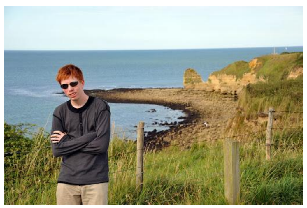
Distracting background/no depth/sunglasses