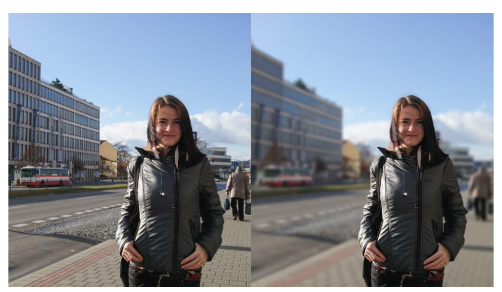
Example of competing background vs edit to make it less so